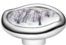
grove of trees RG1296-01-508